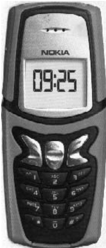
Nokia 5210—Actual size