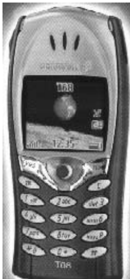
The full colour screen Ericsson T68